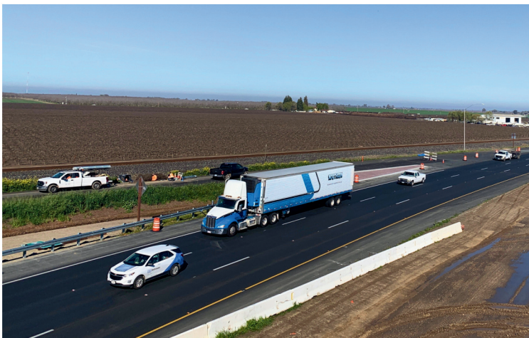
In the coming years, a five-mile stretch from south of Avenue 200 to north of Prosperity Avenue in the City of Tulare will be widened and improved.