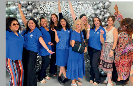
Groovy Women of TCAG

We are pleased to announce that we successfully completed LocalMotion under budget. Through careful planning, and the dedication of our team, we were able to execute a successful event. We look forward to doing the same in 2026.