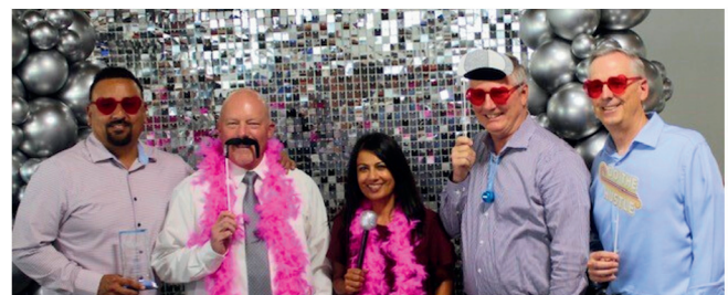
Caltrans District 6 Staff Displaying Award