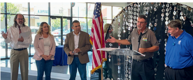
City of Farmersville Receiving Award